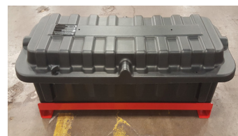
Protective Battery Box