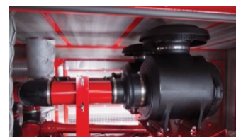
Two Stage Air Cleaners