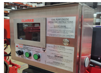
NEMA 4X/IP66 Stainless Steel Instrument Panel