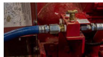
Pressure Limiting Driver