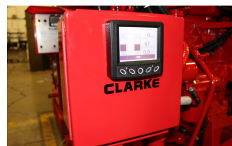
Full Alarm/Gauge Package